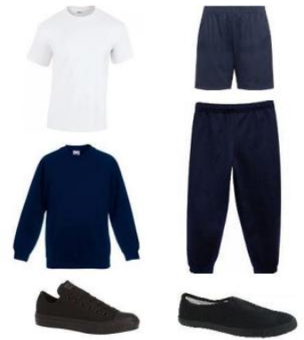
PE kit Years 1 - 6

Please ensure all uniform is named. Pupils should attend school wearing their indoor PE kit on a Tuesday and their outdoor PE kit on a Thursday . They will stay in their PE kit all day and will not need their school uniform on these days. Please ensure that no earrings are worn on PE days.